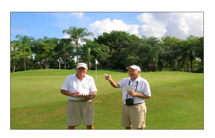
Love the pictures...keep 'em coming!!